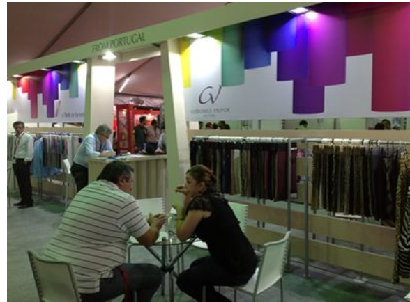
Worldwide leading fabric shows

It was a promising debut for Gierlings Velpor at Heimtextil 2013. The new Jacquard Velvet collection was received with enthusiasm by most of the buyers who visited our stand. Likewise, the new range of Certified Flame Retardant velvets for the Contract segment brought a new competitive perspective to the business. A wide variety of heterogeneous clients positioned in the medium-high segment from around the world could enjoy them at our booth.